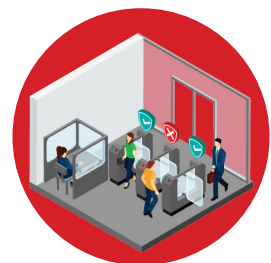
Wrong way detection