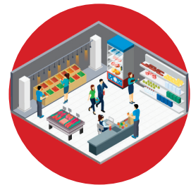
Retail occupancy monitoring