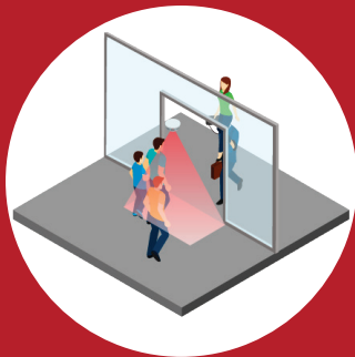
Counts people passing