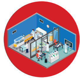
Minimum occupancy Monitoring in laboratories